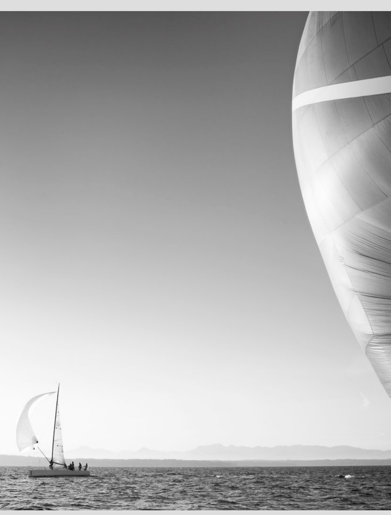
Eurobank Private Bank Luxembourg S.A.